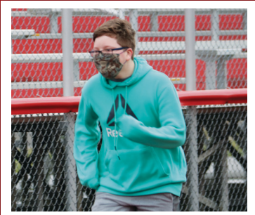
Mrs. Mika's seventh grade science class ran/power walked 100 meters for a fun science lesson. They calculated the average of their three times to determine their average speed.