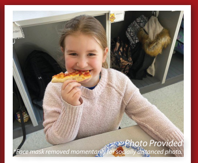
What better way to celebrate the end of a fractions unit than learning how pizza pies represent fractions that make up a whole? Mrs. Williams's class enjoyed this lesson a lot!