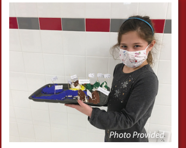
Second grade students worked hard to research and study different landforms. They then designed and constructed their own landforms out of salt dough.